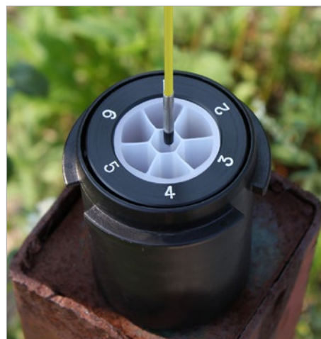
Measure water levels within the narrow channels of a Solinst CMT® System.

The 102M Mini Water Level Meter is available in 25 m and 80 ft lengths. There is the choice of the P4 or P10 Probe.