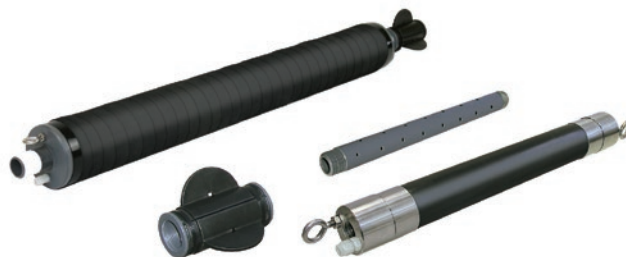
Model 800 Packers 3.9" and 1.8" (99 mm and 46 mm)

Model 800 Low-Pressure Packers can be used with Solinst Bladder Pumps to minimize purge times by reducing purge volumes. This reduces the cost of water disposal and labour. Packers are available in single point or straddle packer designs, and in sizes to fit 2" (50 mm) to 5" (127 mm) dia. wells. (See Model 800 Data Sheet.)