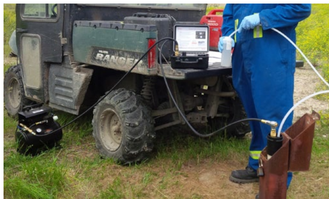
Sampling with a Dedicated Bladder Pump using Portable, Rugged, Easy-to-use, Compressor and Controller

For water level monitoring there is an access hole to fit a Solinst Model 101 Water Level Meter or Levellogger. An eyebolt is provided for a pump support cable or for suspension of a Solinst Levellogger, (see Model 3001 Data Sheet) or other device.