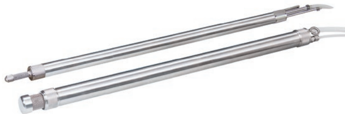
Solinst Bladder Pumps available in Stainless Steel 1" and 1.66" (25 mm and 42 mm).