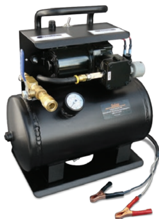
12 Volt Compressor

The compressor operates using 12 volt DC power source, such as a car or truck vehicle battery, and comes with alligator clips. The compressor operates at up to 125 psi and is equipped with a 2 US gallon (7.6 L) air tank which is rated to 150 psi.