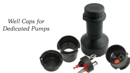
Well Caps for Dedicated Pumps

The caps slip easily onto 2" dia. (50 mm) wells. Adaptors to fit 4" dia. (100 mm) wells are also available. They have quick-connect fittings for the drive and sample tubing.