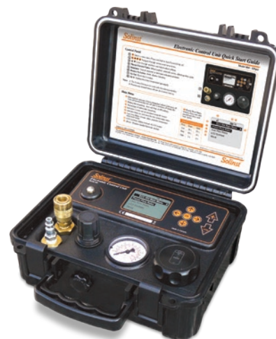
Model 464 Electronic Control Unit (125 psi and 250 psi Models)

These convenient Controllers are rugged, dependable and suitable for all environments. Quick-connect fittings allow instant attachment to dedicated well caps, portable reel units and to an air compressor or compressed gas source.