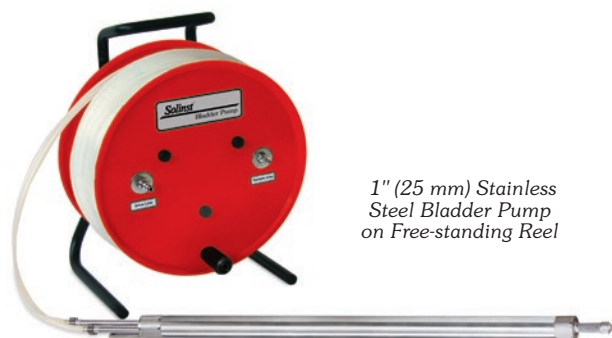
1" (25 mm) Stainless Steel Bladder Pump on Free-standing Reel

They are supplied on a free-standing reel. The rugged systems are very convenient and easy to transport. Tubing fittings on the reels and controller are compression fittings, allowing quick set up in the field. The Solinst Model 103 Tag Line can be used to lower and support the pump in the well (see Model 103 Data Sheet).