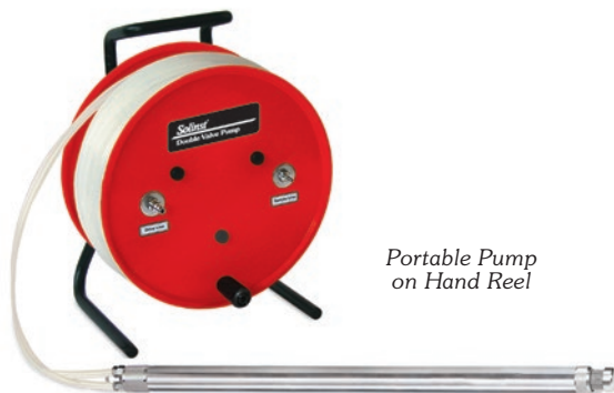
Portable Pump on Hand Reel

For less frequent sampling, reel mounted portable systems allow access to multiple monitoring wells, even in remote locations. The reel mounted portable units are free-standing with a convenient carrying handle. They can be made for almost any size or depth of application.