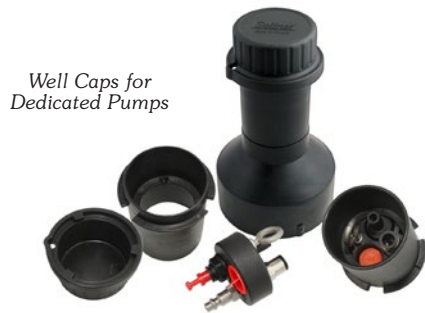
Well Caps for Dedicated Pumps

The DVP is suitable for low flow or regular flow sampling. The stainless steel pumps can operate to depths of 500 ft (150 m).