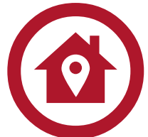
Indoor location compatible